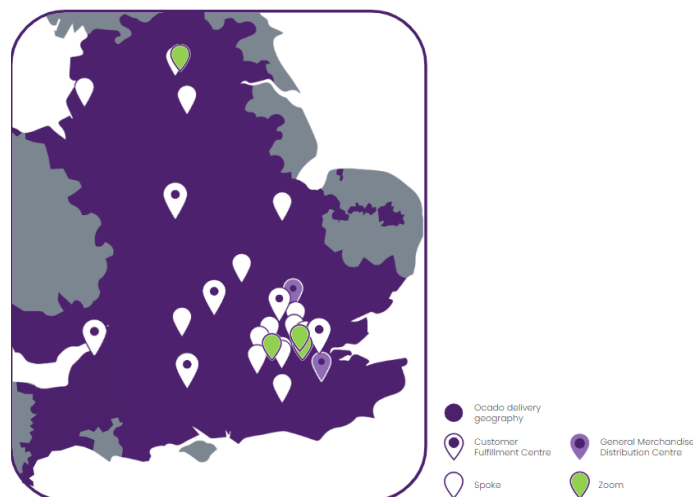
Figure 1: Ocado Retail Coverage Map

We do not have international operations.